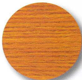
006 Light Oak