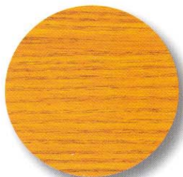
003 Clear Satin