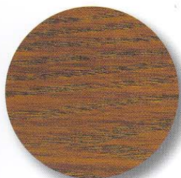
009 Dark Oak