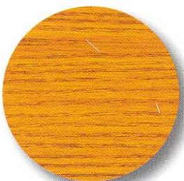
003 Clear Gloss