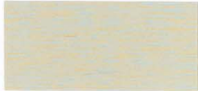
221 Ocean Mist