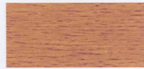
247 Natural Redwood