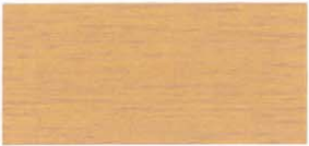
218 Natural Tone