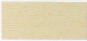
234 Pale Wheat