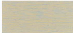
220 Mountain Ash