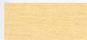
268 Ginger Root