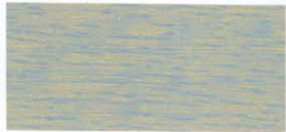
409 Colonial Blue