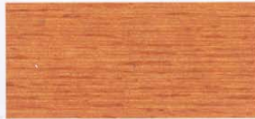
219 Honey Brown