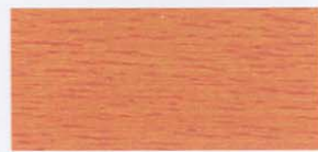
246 Terra Cotta