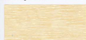
231 Navajo White