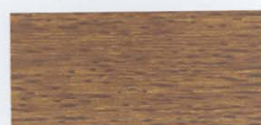
201 Chestnut Brown