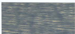
229 Mountain Grey