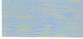
284 Crystal Stream