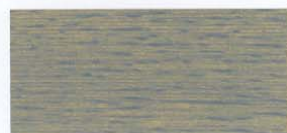
225 Harbor Grey