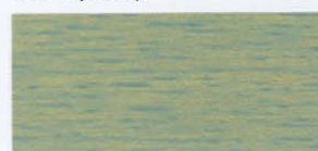
408 Woodland Green