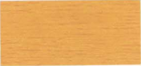
216 Natural Cedar