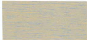
520 Fog Grey