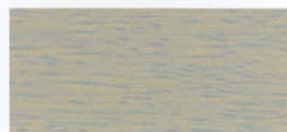
226 River Bed