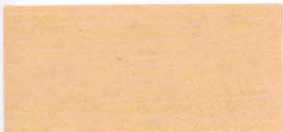
208 Desert Tan