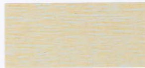
283 Silver Birch