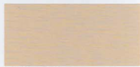
244 Coral Mist