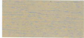
223 Blue Granite