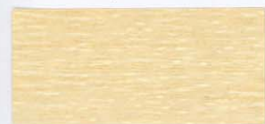
266 Corn Silk