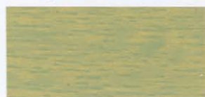
274 Moss Green