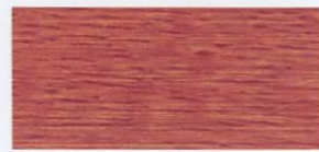
052 Navajo Red