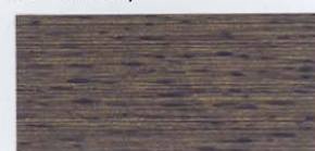
058 Oxford Brown

Color samples represented here can only approximate the actual color. Colors may vary by type of wood, age of