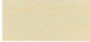
235 Winter Mist