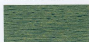
414 Forest Green