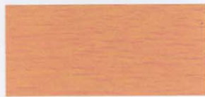
245 Burnt Clay