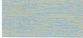
285 Arctic Blue