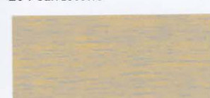
210 Sahara Sand