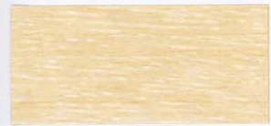
233 Warm White